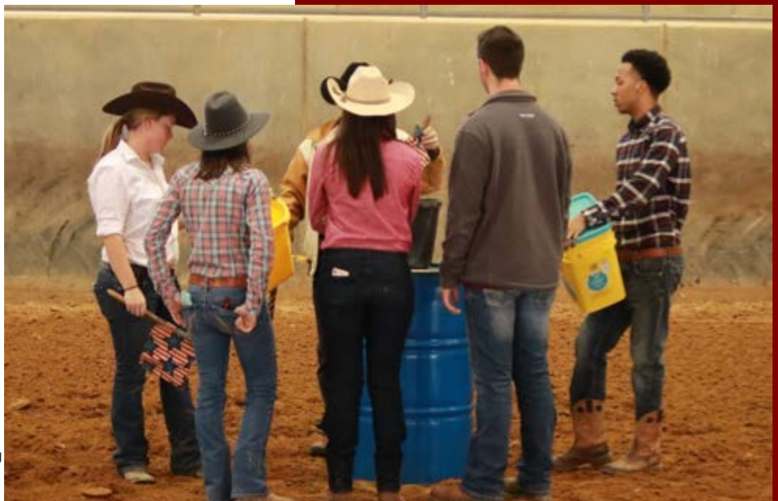
ADS Student Volunteers setting up for flag races at the HOPE Show